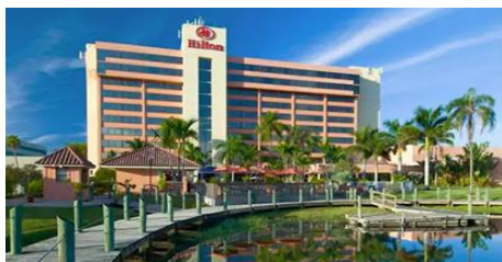
Hilton Palm Beach Airport 150 Australian Avenue West Palm Beach, FL 33406

Save - The - Date 2019 Florida NENA Fall Training Conference & EXPO